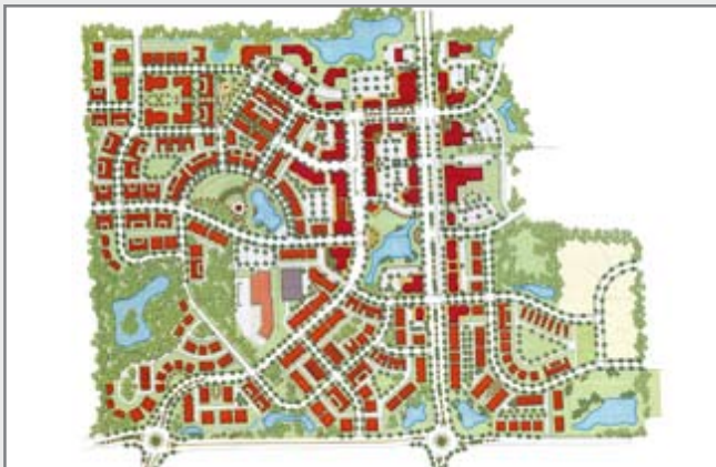
The image above shows the most recent plans for the Village Green Center. Highway 165 is shown at the bottom of the image, while 39 th Avenue is the main north south roadway shown.