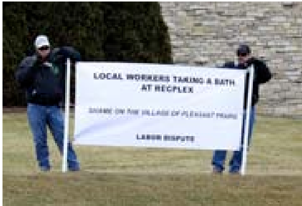
Members of the Carpenters Union stand outside Village Hall on 39 th Avenue, because the Village selected Neuman Pools for a portion of the work on the new competition pool at RecPlex.

Periodically throughout the month of March, members of a local Carpenters Union have been standing in front of Village Hall. The Union is protesting the Village hiring of Neuman Pools as a contractor for work on the new competition pool at RecPlex. Members of the Chicago Regional Council of Carpenters Local 161 have also picketed at RecPlex.