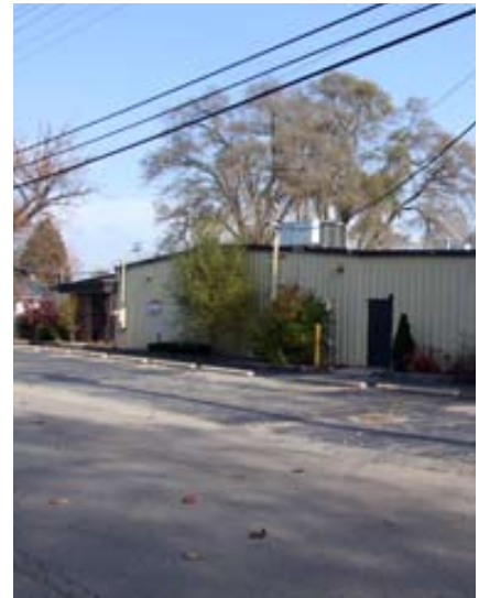
Future Springbrook Innovation Center and former Midwest Copier/Manutronics site located at 9115 26 th Avenue

A response to the request is expected this spring. If approved for funding, construction of the project could begin during the spring of 2010. Construction is expected to take approximately one year, which could make the facility operational during the spring of 2011.